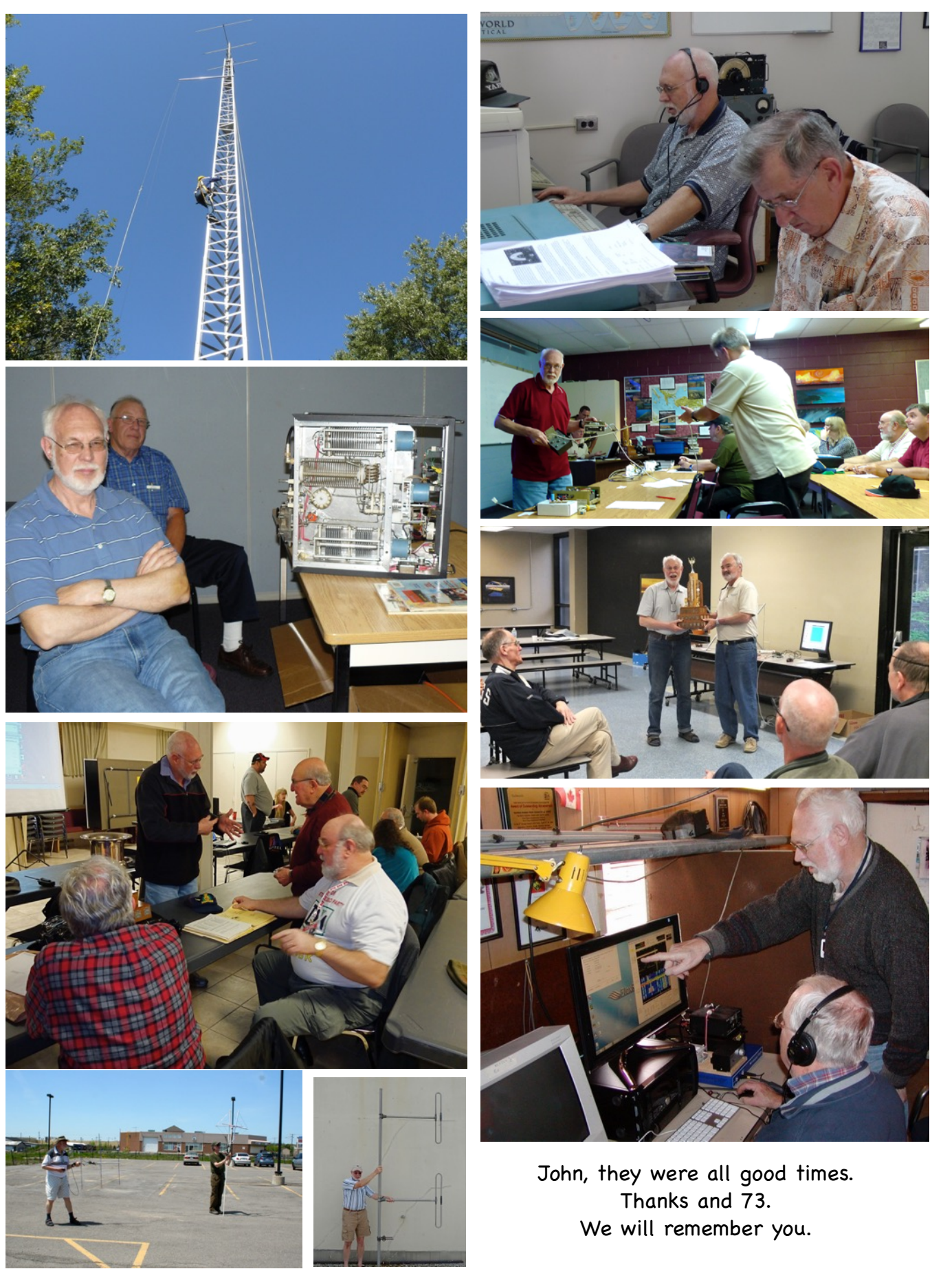
Volume 83, Number 8