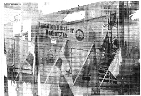
A picture looking up to the ham shack on the mezzanine level at the Warplane Heritage Museum — Mount Hope, taken by Fred, VE3GCP

If you would like to get involved at the station, or just make a visit, contact Frank, VA3FWL, or Doug, VE3NBL, and we can discuss your interest.