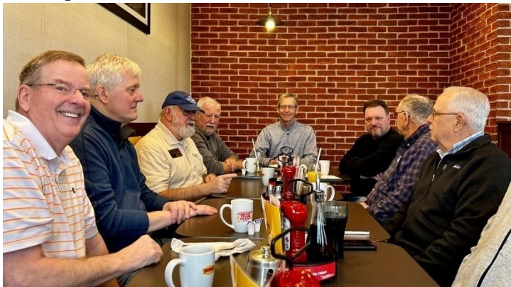
A great turnout with 12 members