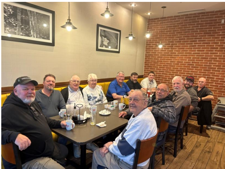
Club members enjoying breakfast at Denny's 15 th March 2025.